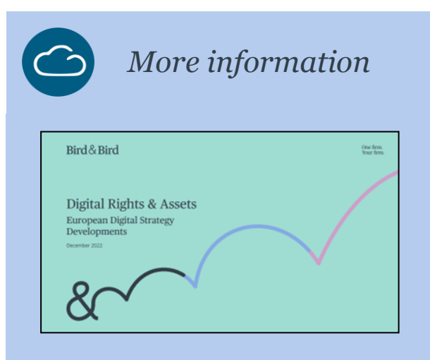
Access our European Digital Strategy Developments tool guide at <u>twobirds.com</u>